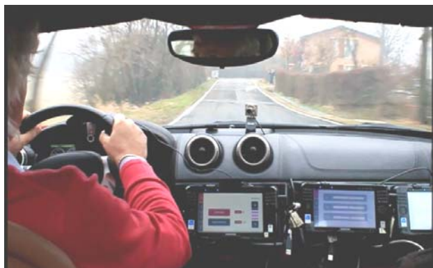
© Reflect project - Vehicle as a co-driver prototype

A vehicular setting contains sensor devices for physiological and performance monitoring and actuator devices that can influence the driving process. Four bio-cybernetic loops are capturing emotional, cognitive, physical and behavioural aspects of the driver's state. Each loop has been separately evaluated and assessed in a simulating environment and then deployed in the vehicular demonstrator.