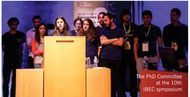
The PhD Committee at the 10th IBEC symposium

Just before the summer break, the 5th IBEC Beach Volleyball tournament took place on Friday 16th June at "Nova Icaria" beach, with 7 teams taking part, and during the same month the Committee participated in the organization of the activities