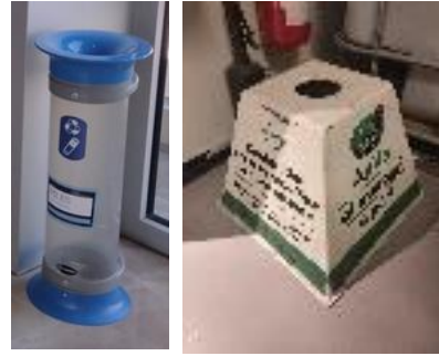
BATTERY BIN • Batteries