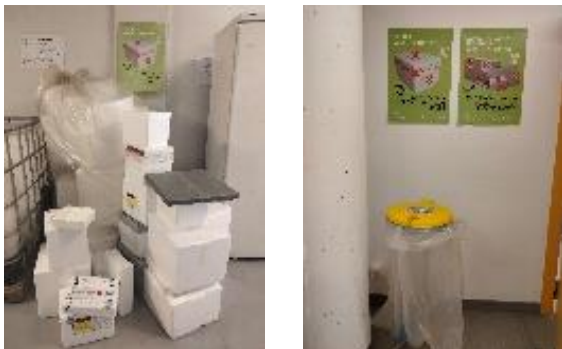
POREXPAN COLLECTION POINTS