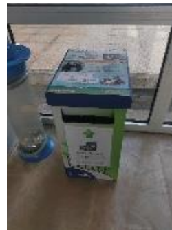
MOBILE PHONES AND TABLETS