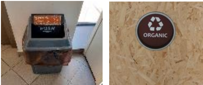
ORGANIC BIN • Organic waste