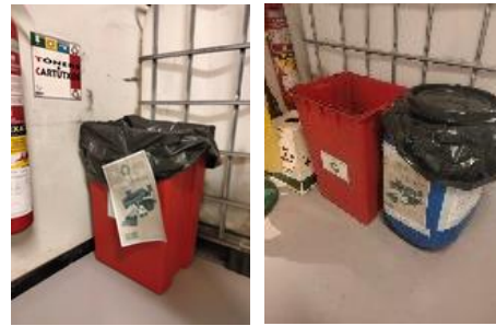
TONER BIN • Printer toner