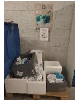
COLD BLOCKS COLLECTION POINTS