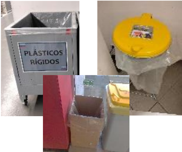
HARD PLASTIC BINS • Tip holders • Tip boxes • Bottle taps